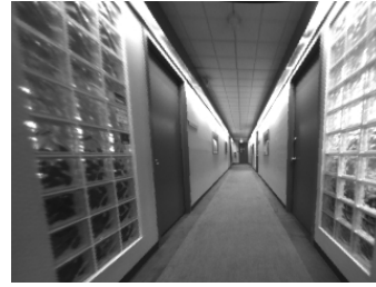
Figure 2: Rectified pin-hole model image

The accuracy of the 3D results of stereo matching depends upon many factors such as image texture, image resolution, lens focal length and the separation between cameras. Increase in camera separation or narrower field-of-view lenses improve the accuracy at long range. Higher image resolution increases the accuracy of the results but also may increase the processing time.