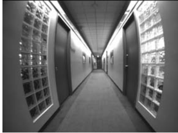
Figure 2: Wide-angle lens with barrel distortion

Camera calibration is done before using the stereo rig. For dense stereo algorithms, typically the images from the cameras must be remapped to an image that fits a pin-hole camera model. This remapped image is called the rectified image. For lenses with barrel distortion , straight lines in the world will appear curved in the image. In the rectified image, however, barrel distortion is removed and straight lines will appear straight.